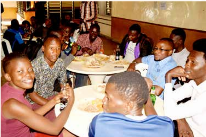
Snapshots of the End of Year Party activities