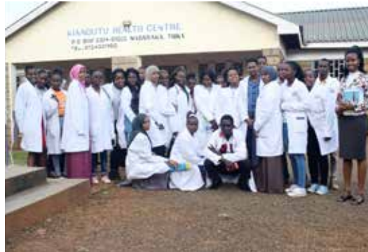
A Group Photos of Professional Health Workers from Thika Level 5 Hospital, St. Matia Mulumba Hospital, Caritas Community Hospital and Greta University, School of Health Sciences Staff

G retsa University in collaboration with Doctors and Nurses from the Thika Level 5 Hospital, St. Matia Mulumba Hospital, Caritas Community Hospital and the support of Jungle Foundation successfully organized a Free Community Medical Camp on Friday 14th June 2019 targeting members of the community from around the university. Medical services offered included Nutrition Assessment, General Consultation, Blood Pressure Screening, Blood Sugar Testing, Family Planning Services, Cervical Cancer Screening, Prostate Cancer Screening, Breast Cancer Screening and HIV Testing Services. The event was also meant to offer practical learning experience to the students in the School of Health Sciences.