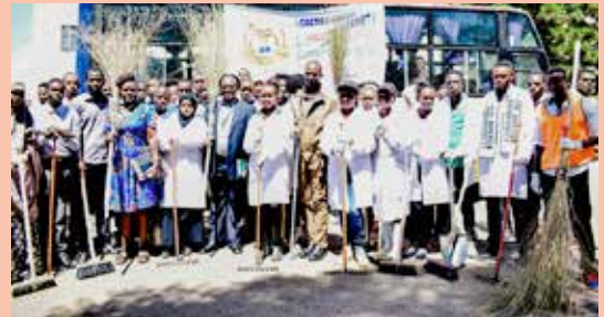
The theme of the clean-up event was ‘Mazingira Safi, Jukumu Langu’