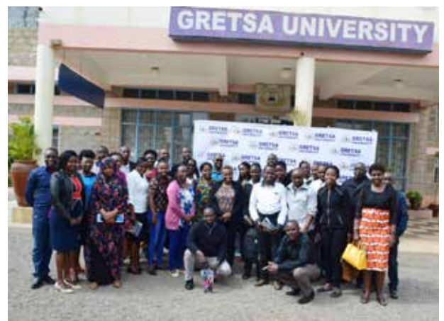
A photo of the participants of Koha LMS Workshop