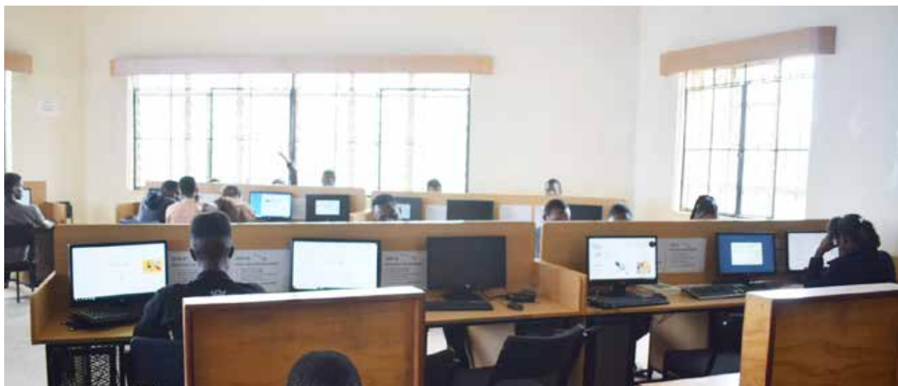
The New Library Research Centre

By: Mugambi Frankline Department of Library and Information Services