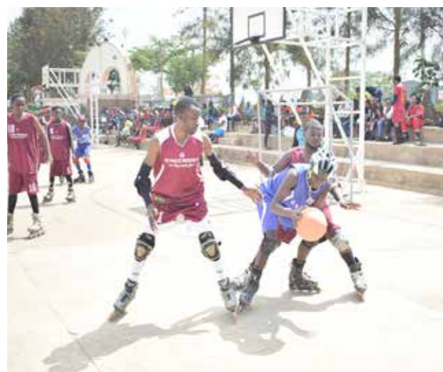
Gretsia Spartans vs St. Paul University in a Rollball action