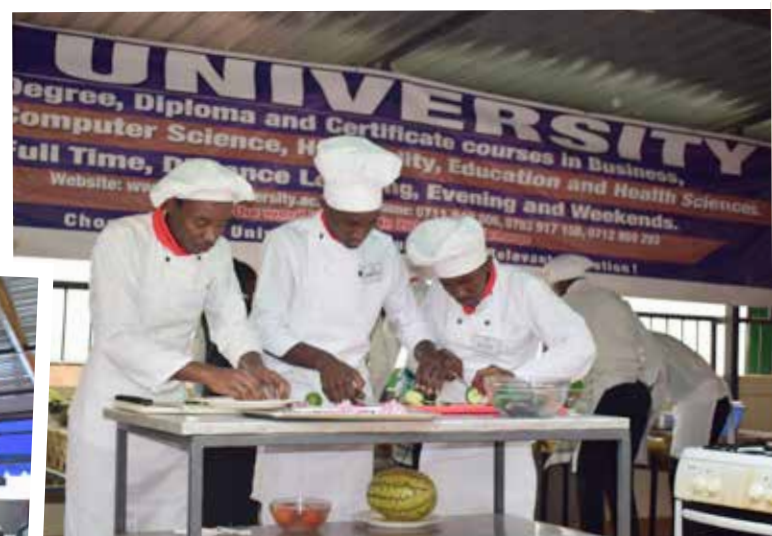
Contestants showcase food presentations skills