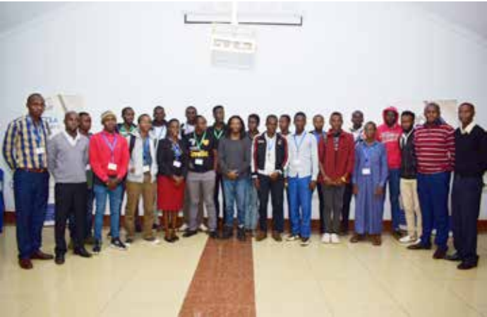
A Group Photo of contestants, judges and staff during the event

The national Programming Contest was held on 18th July 2019. The event was held to provide a platform for computing students to showcase their creative ability in programming IT solutions to prevailing community challenges. This years event attracted 35 contestants from Gretsas University, University of Nairobi, Thika Technical Institute and Egerton University. The contestants were required to create and present within five hours mobile applications, web applications or basic website that would make it easy for ordinary Kenyan citizens to access services on the Big Four Agenda on universal health, affordable housing and food security.