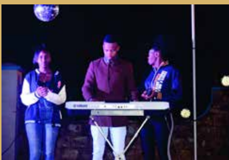
Students showcase their singing talent

T his event was held on 29 March 2019. Hundreds of contestants turned up for the show with 70 contestants being selected to showcase their talents in different categories which included Music, Spoken Word, Comedy, Dance, Art and Football Commentation. The show returns next year and promises more fun and thrill.