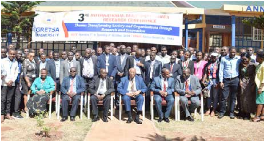
A group photo of the Conference Participants