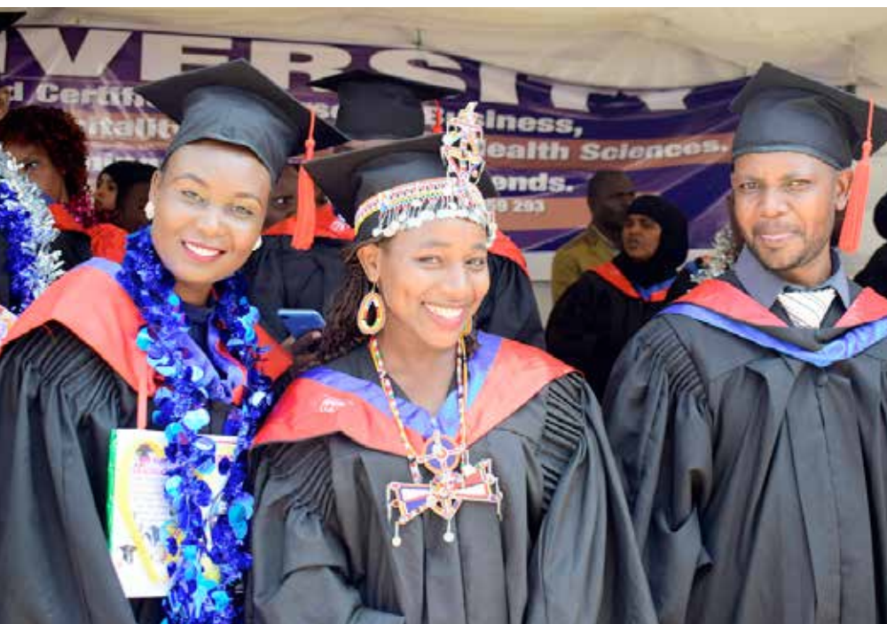
2018 Graduands on their graduation day