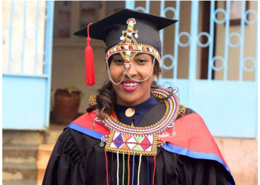
An elated 2018 Graduand

Gretsia University has introduced you to the concept of life-long education by its very nature of the University mode of facilitating learning through formal lectures, tutorials, class discussions besides the non-formal