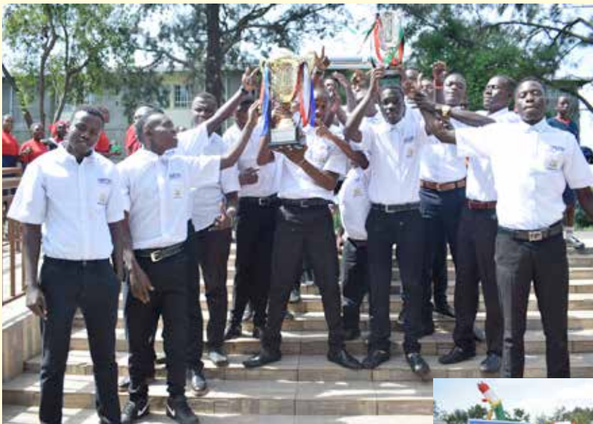
Gretsa University Music Club Celebrate their triumph during the Kenya National Music Festival at Kabarak University