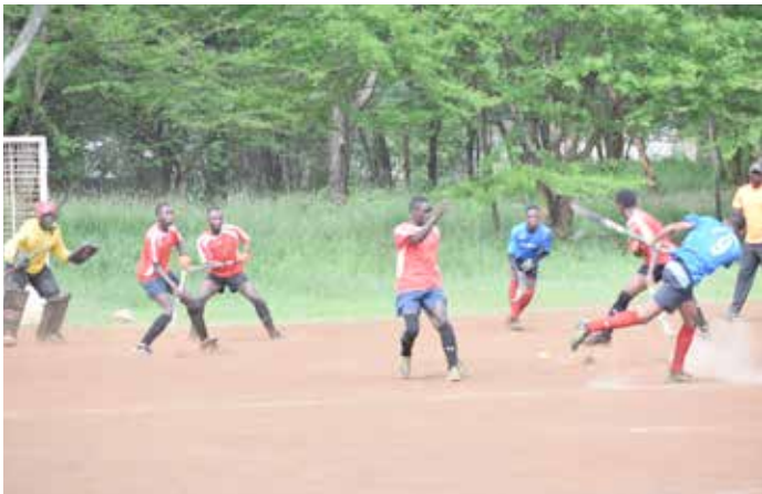
Hockey Men: Greta vs Daystar University