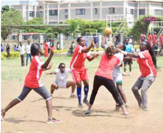
Handball ladies: Greta vs Mpesa Foundation Academy

By: Chereste Wahome Media and Photography Unit