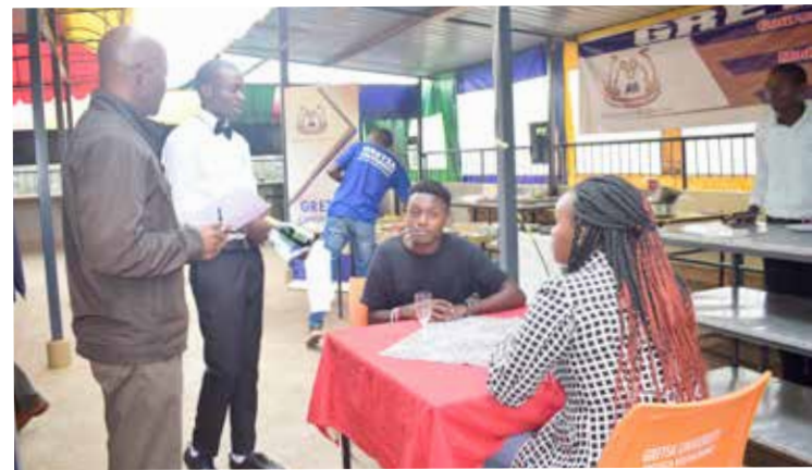
A Judge inspects a Contestant's Service of Sparkling Wine