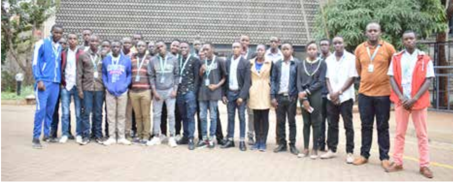
School of Computing and Informatics Students at Andela Kenya

PC and transmits the signals between the virtual PC and the shared PC. The solution is easy to deploy and maintain. NComputing systems are compatible with Windows, Linux and standard PC applications. As a major leap forward in green computing.