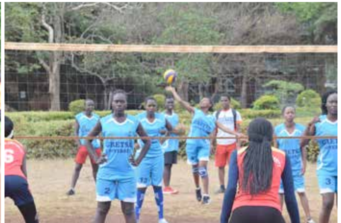
Volleyball Ladies: Greta vs St. Paul University