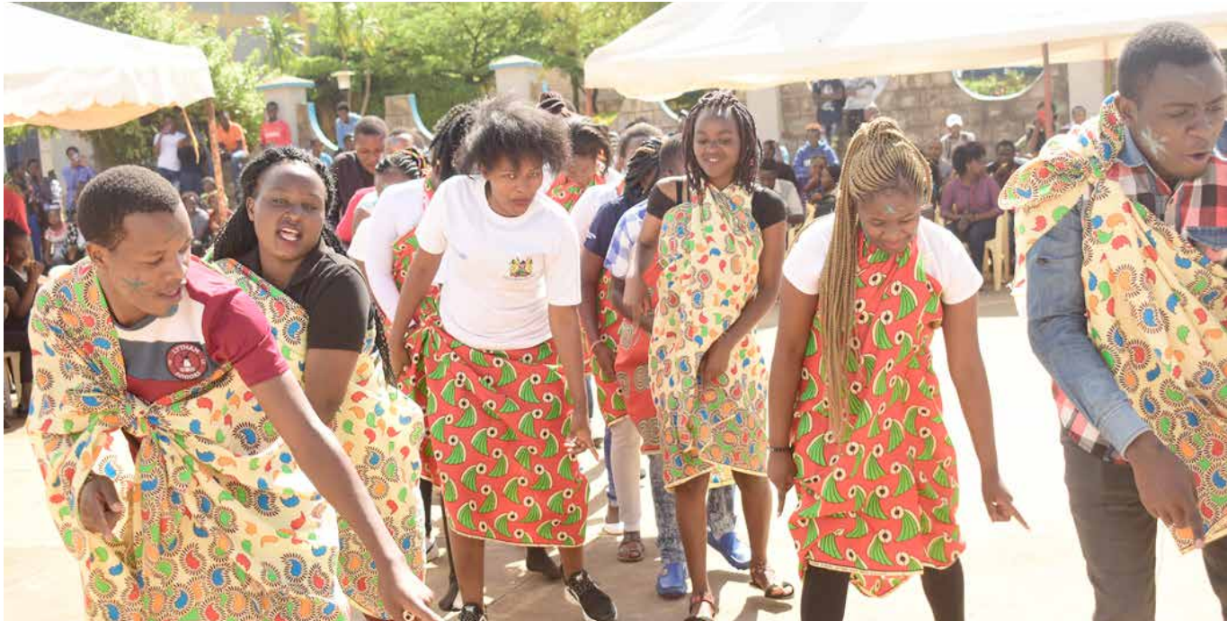
A Kamba Traditional Dance