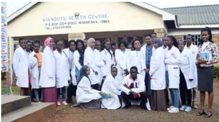
Gretsa Health Sciences Students Pose for a Group Photo at the Kiandutu Health Centre