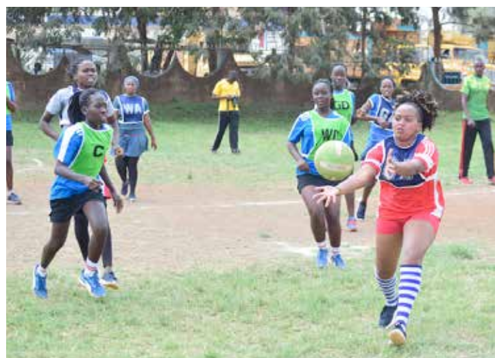
Netball Ladies: Gretsia vs JKUAT Karen Campus