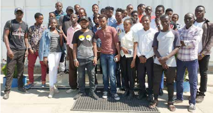
School of Computing and Informatics Students at Computers of School Kenya

NComputing is a desktop virtualization technology that creates zero clients or thin clients which enable multiple users to simultaneously share a single Operating System or Central Processing Unit. With NComputing technology each user’s monitor, keyboard and peripherals connect to a small NComputing access device (virtual PC) that connects to the shared OS/PCU. NComputing virtualization software shares the overabundant processing power of the