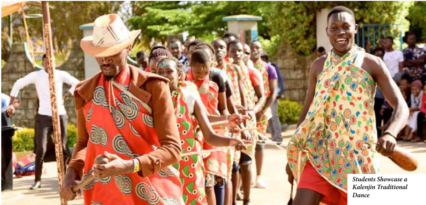
Students Showcase a Kalenjin Traditional Dance