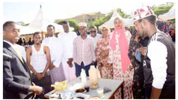
Students show how “anjera” is prepared among the Borana Community

Speakers encouraged students to embrace positive culture behaviours stressing the need for unity as none is born with culture but all are born into a culture. Members of staff present during the event were; The Vice-Chancellor, Academic Dean, the Director of Research and Publications, Dean of students as well as academic, administrative staff among others. Celebrated annually, this year’s cultural event lived up to its billing as the biggest cultural event in the University Calendar.