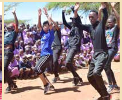
Gretsa University Dance Group Performs during the Visit