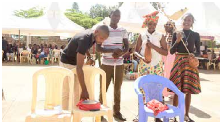
Students showcase preparation of “mursik” in the Kalenjin Community