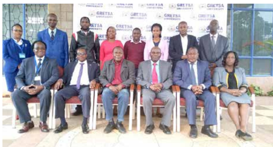
A Group Photo of PHOTC Inspection Accreditation Team with University Staff