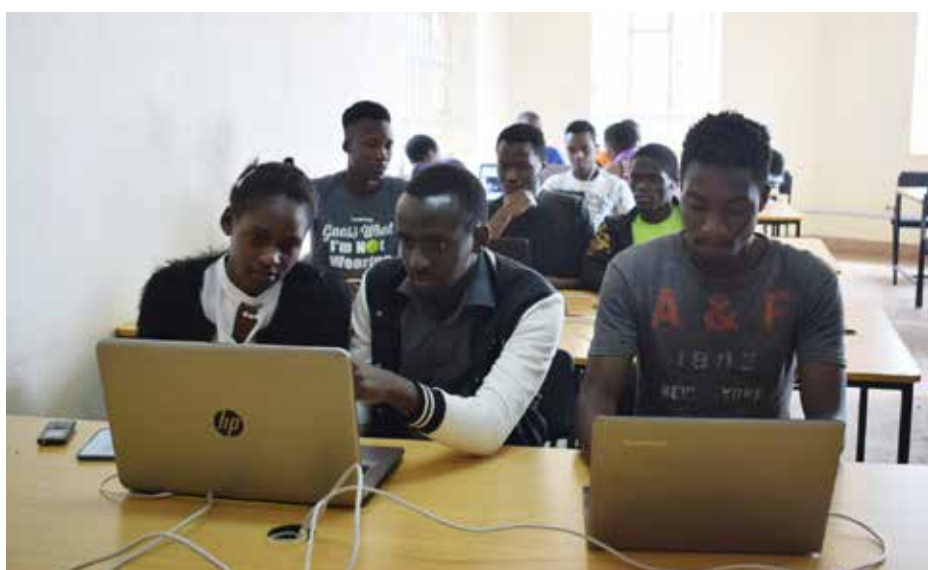
The New Computer Software Development Lab

The university has created a new software lab which offers computing and Informatics students and lecturers a dedicated space to work creatively and collaboratively on software projects that will offer solutions to societal challenges.