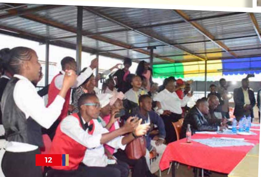
Spectators cheering their favorite team