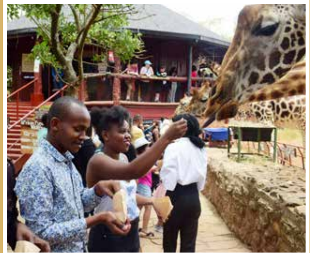
Snapshots of some Tourism Management Students at Bomas of Kenya, Giraffe Centre and Sawela Lodge

The excursion involved visits to the Giraffe Center, Bomas of Kenya, Nairobi National Museum, Snake Park, Lake Naivasha Sawela Lodge and Lake Naivasha. These tourism destinations provided guided tours to the students under the supervision of a university lecturer in-charge. In addition to acquiring tourism product knowledge from the organizations visited, the students had fun as tourists with the happiest moments being recorded at Bomas of Kenya where some participated on-stage in cultural dances.