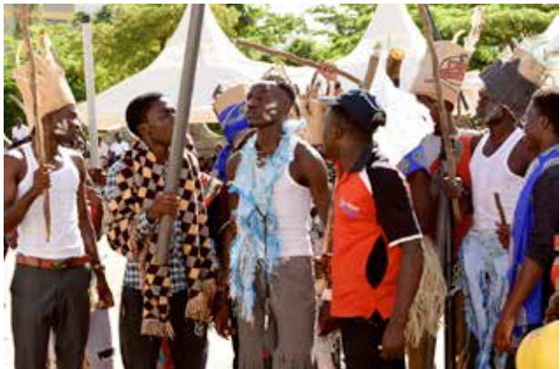
Demonstration of a Luhya Traditional Circumcision Process