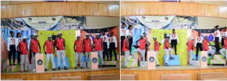
Snapshots of Gretsas Drama Club Participating at the Kenya National Drama Festivals at Kibabii University in Bungoma County