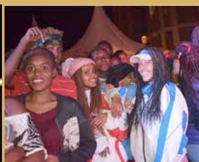
Thrilled Gretsas Students at the Talent Show