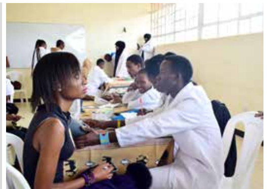
Snapshot of Health Practitioners busy at work during the Free Community Medical camp.