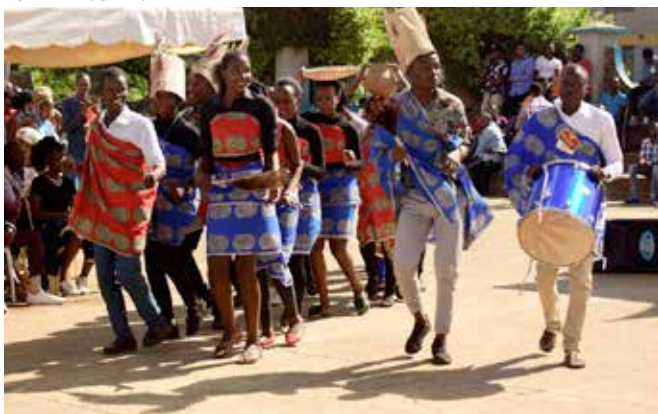
Grand stage entry to perform a Kisii Traditional Dance