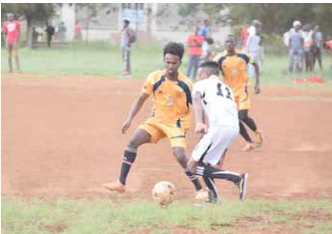
Football Men: Greta University vs USIU