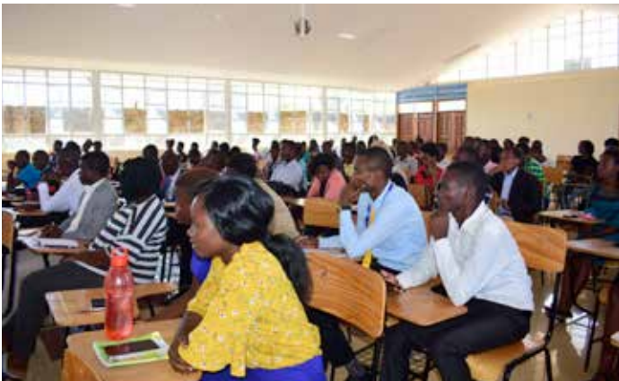
Students at the Public Speaking Forum