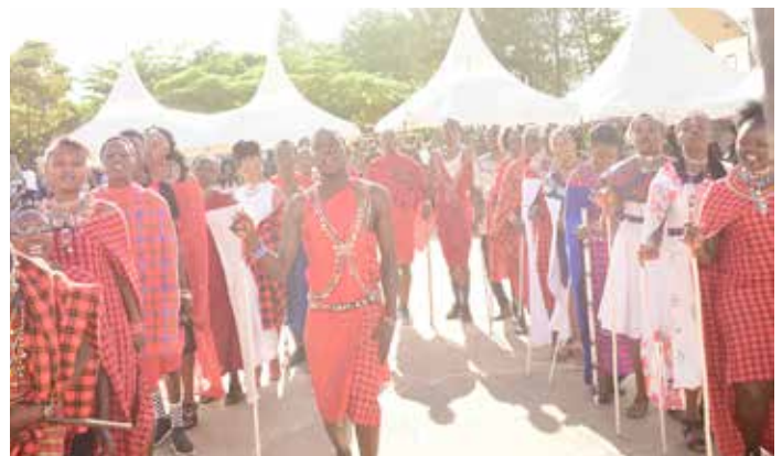
Students Perform Maasai Traditional Dance