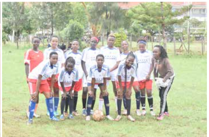
Greta Football Ladies Team