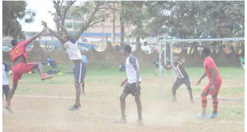
Handball Men: Greta vs St. Paul University