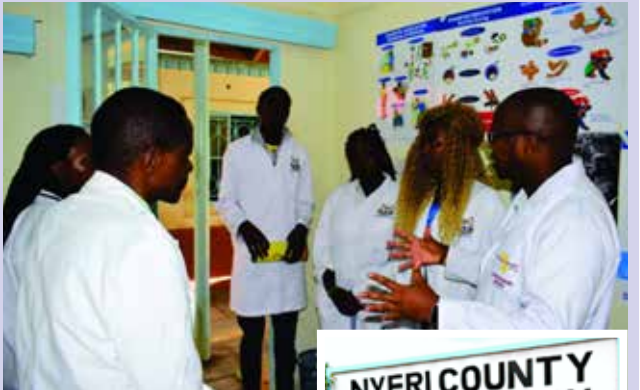
School of Health Students at the Nyeri County Referral Hospital

T he study visit was conducted on Thursday 28 February, 2019 and was meant to expose the students to the real work environment and also to give them a chance to relate the knowledge learnt in class to the actual health care provision setup. The visit also opened an opportunity for the students to interact with practicing health officers and they also got a chance to learn different aspects of health records from experienced practitioners.