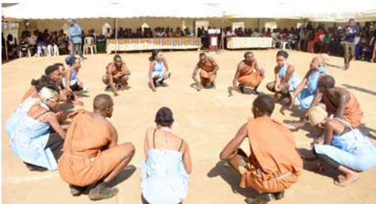
Showcasing of a Kikuyu Traditional Dance