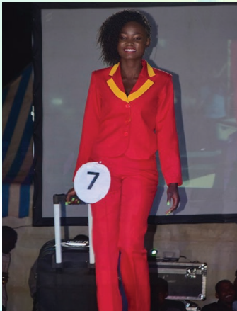
A contestant showcasing her occupational wear

The event was all pomp and glamour. It drew cheers and jeers from the audience. There was immense show of talent from the participants, with everyone trying to outdo the other. The models showed cases their skills on the run way occupational wear, urban African, smart casual wear and lastly dinner wear.