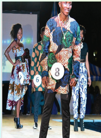
A contestant showcasing Urban African wear