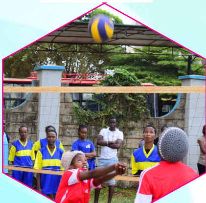
Gretsa Ladies Volleyball Team