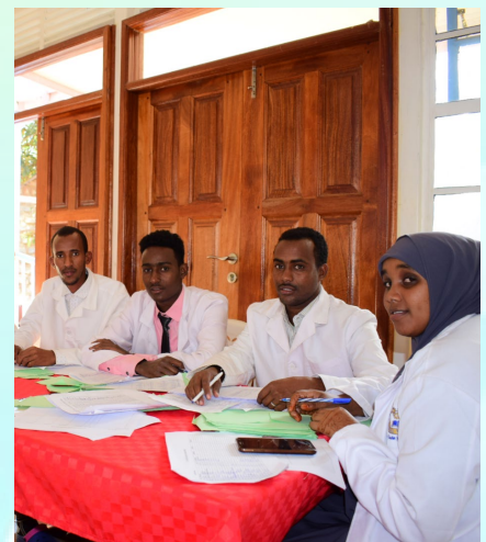
Health Science Students pose for a Photo