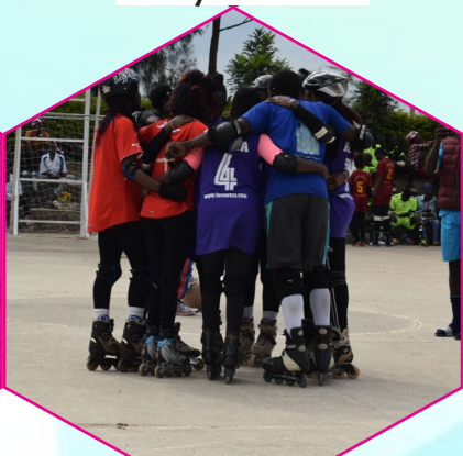
Gretsa Ladies Rollball Team