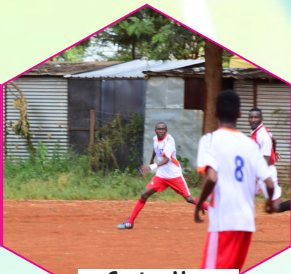
Gretsa Men Football Team