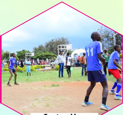
Gretsa Men Volleyball Team