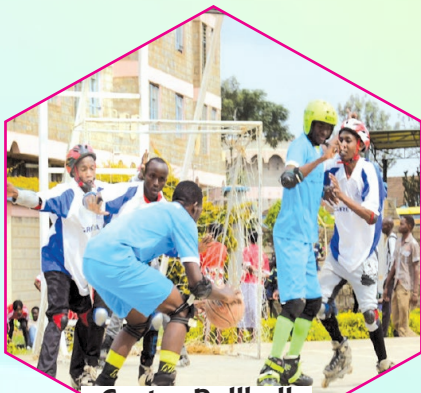
Gretsa Rollball Team