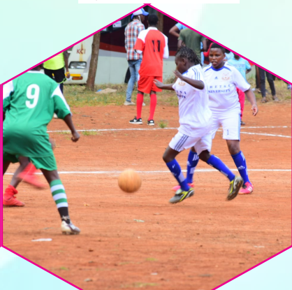
Gretsa Ladies Football Team