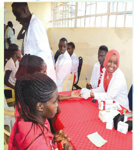
Client being attended to by a health science student and a personnel from Thika level 5 hospital