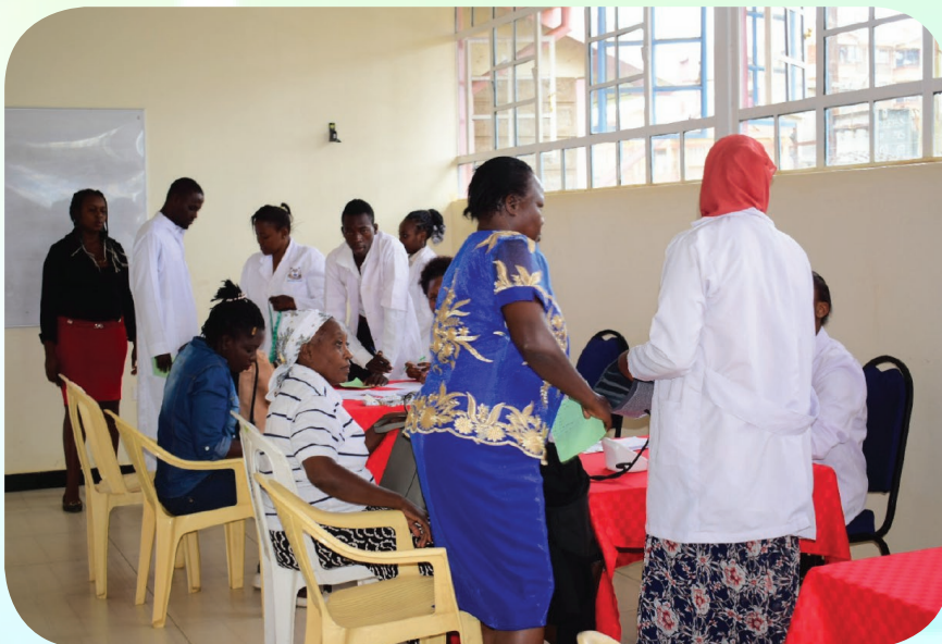
A client being assisted by a health Science Student