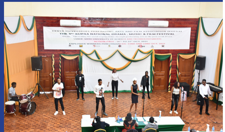
Gretsa Band Members performing a Piece at KUPAA Festivals Held in Meru University