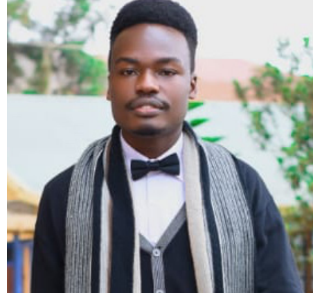
By Donicious Bosire

Congratulations on your richly deserved success! I am sure that this day is just but one among the many proud and successful moments to come. Dream big, embrace life with passion and conquer new territories. Primarily, I am confident that we are all proud of this certification; how I pray we take this as a pathway to make the world a better place and not only a key to good life.