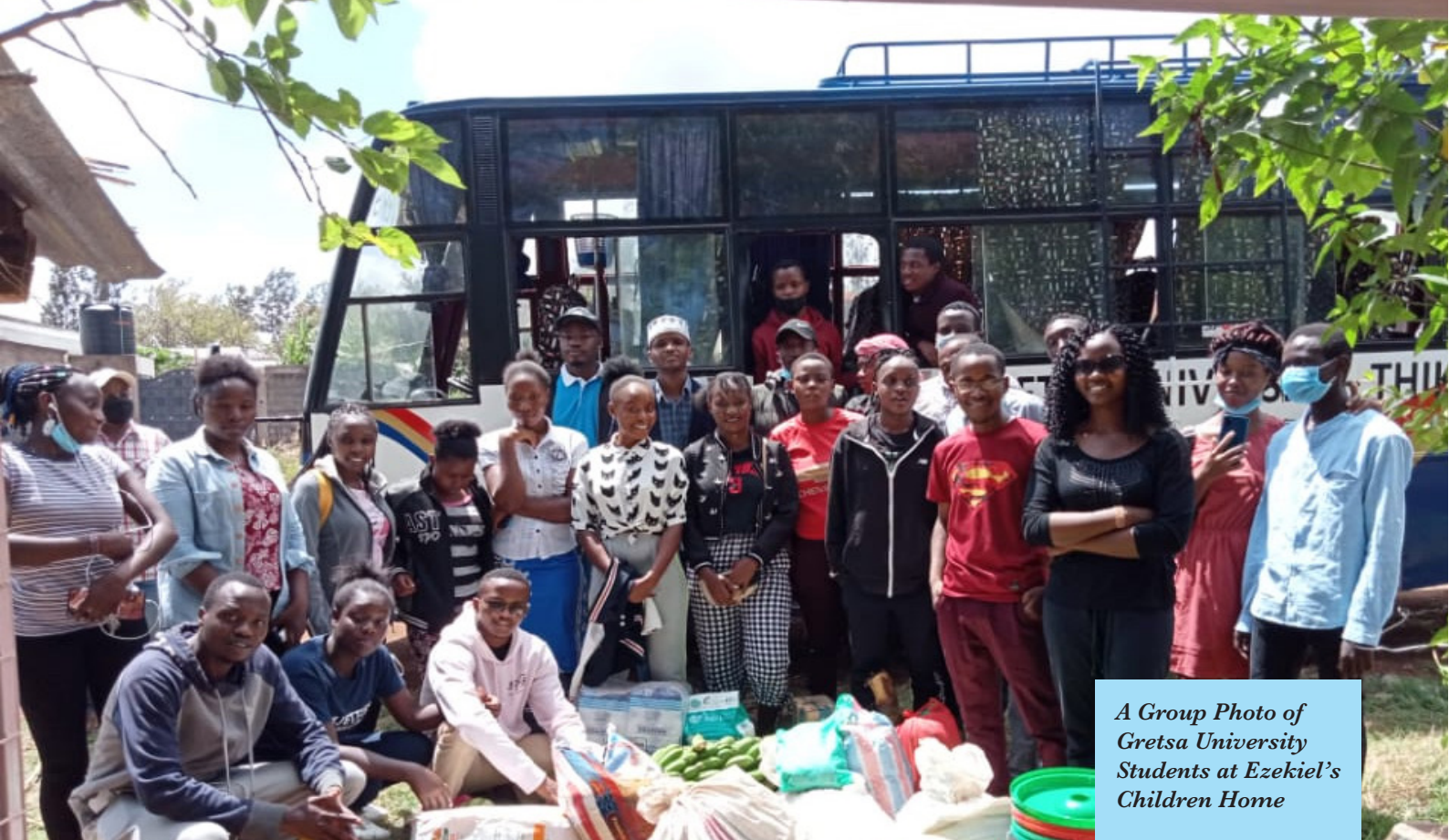
A Group Photo of Grets University Students at Ezekiel's Children Home