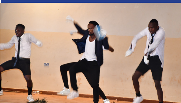
Gretsa University Dancers Performing a Modern Dance Entitled Visionary Cycle at KUPAA Festivals Held in Meru University