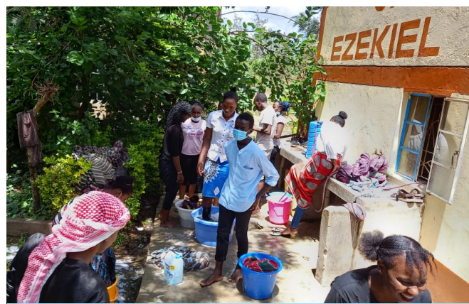
Students give a helping hand in housekeeping duties at Ezekiel's Children Home