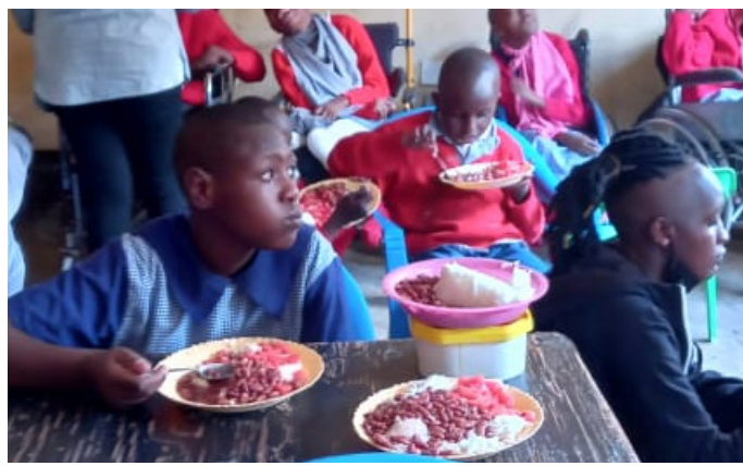
Grets University Students Enjoy a Meal with some of the Children

In life, there is nothing that pleases one's heart than the touch of hope and compassion. To see people's lives change for the better because of your kind-heartedness. On Saturday 13 November 2021 all Grets University societies came together for a good course; they set aside this special day to visit Ezekiel Children's home. They arrived at Ezekiel Children's home loaded with hope, strength and donations.